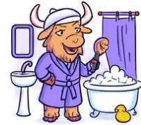
la salle de bain