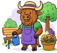
le jardin public