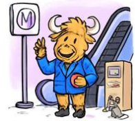
la station de métro