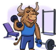
la salle de sport