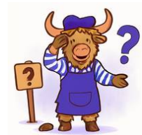
Où est&#8230; ?