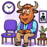
la salle d'attente