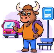
l'arrêt de bus