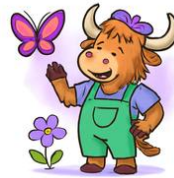
Butterfly /'bʌtə, flaɪ/